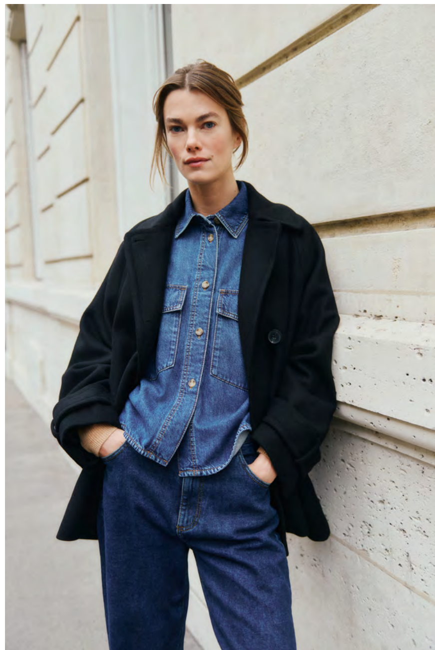
30110518 MableIW Outerwear / 30109358 LukelIW Base Tee / 30110167 SophinalIW Jeans