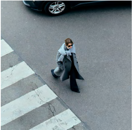
CAMPAIGN FILM >