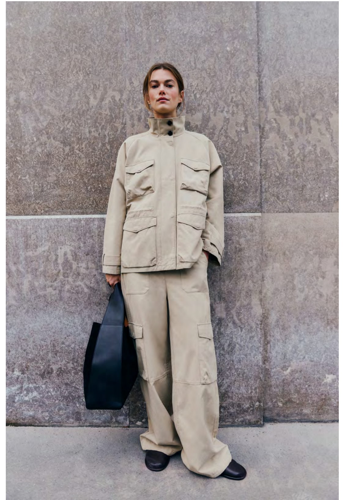
30110865 NickyIW Jacket / 30110912 NickyIW Utility Pants / 30110717 AvikalW Bag