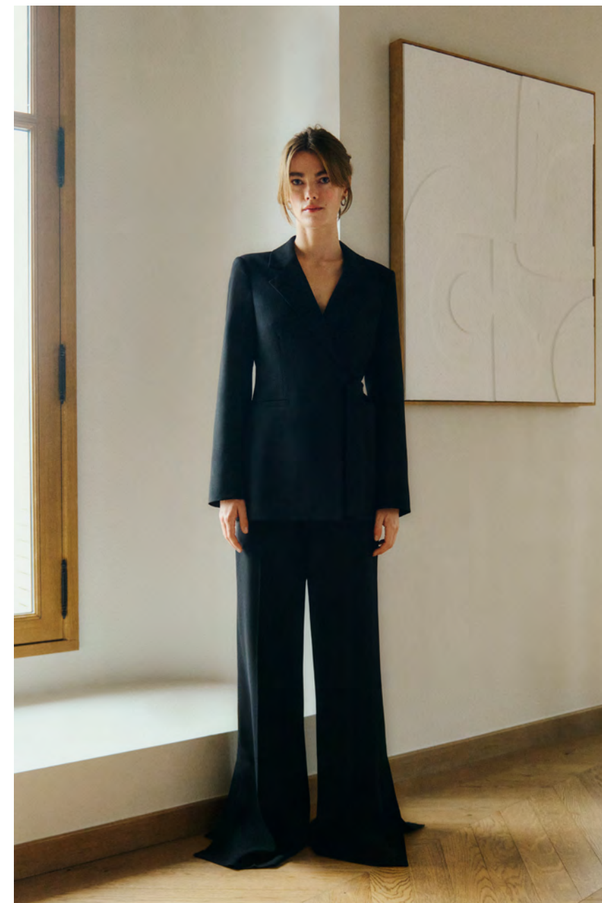
30111071 BrieziIW Blazer / 30110962 BrieziIW Slit Pants / 30111065 AgnesIW Small Earring