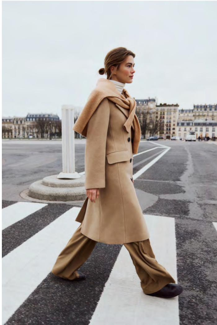
30110808 ThoraiW Lapel Coat R / 30106097 FangIW Rollneck / 30110918 GarolW Monika Henley / 30110959 BriettalW Wide Pants