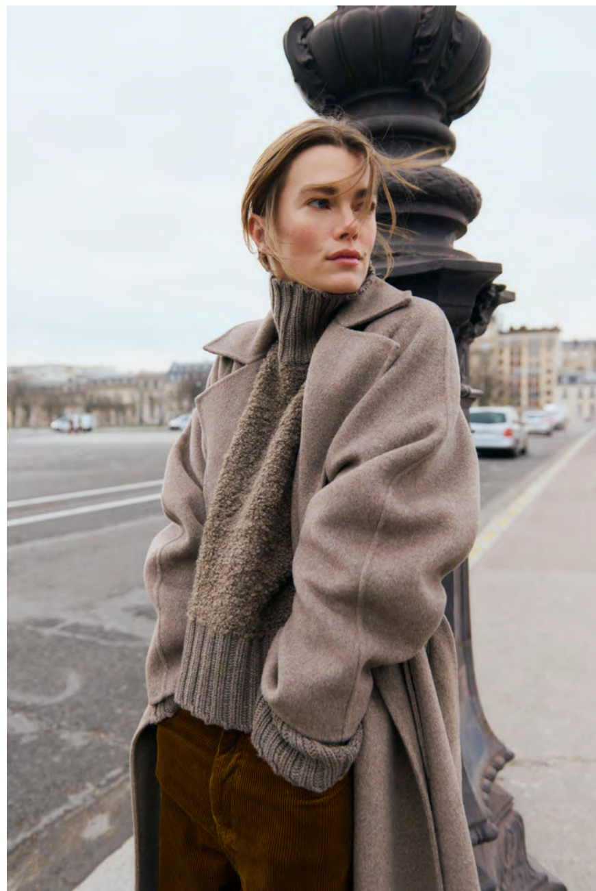
30110937 GuoIW Highneck / 30110978 NanetteIW Wide Pants / 30110608 YillalIW Long Coat