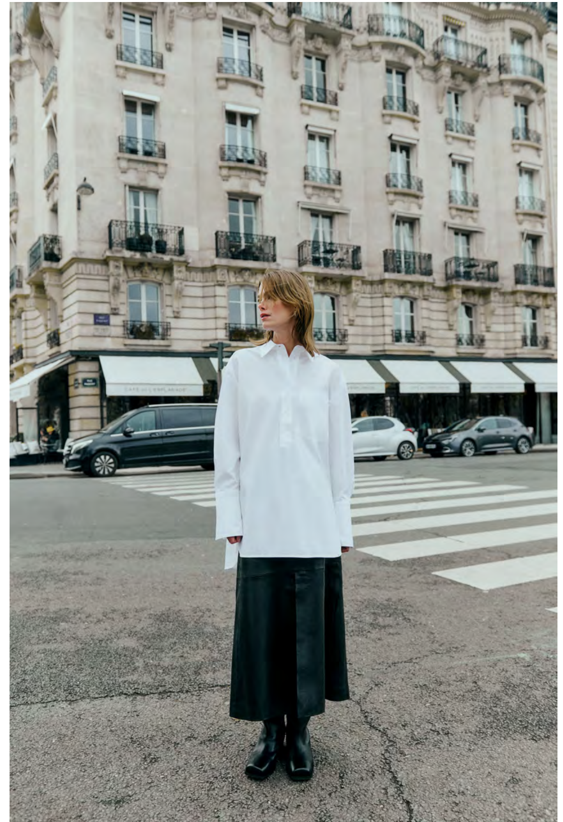
30110885 AtlasIW Oversize Shirt / 30110999 BrodiaIW Skirt