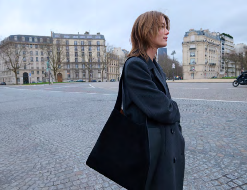
SELLING IN PAGES >