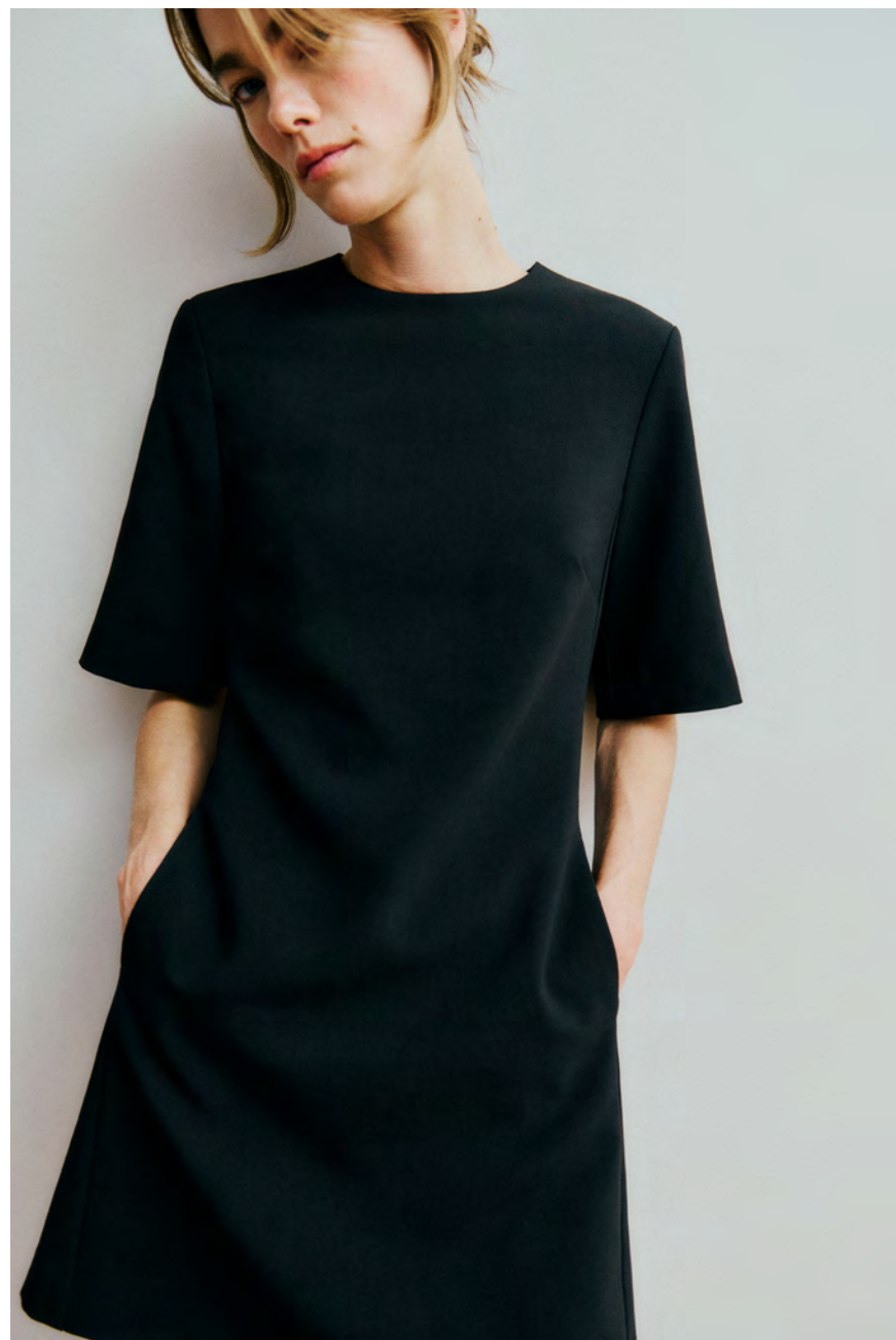
30110995 BryelleIW Dress