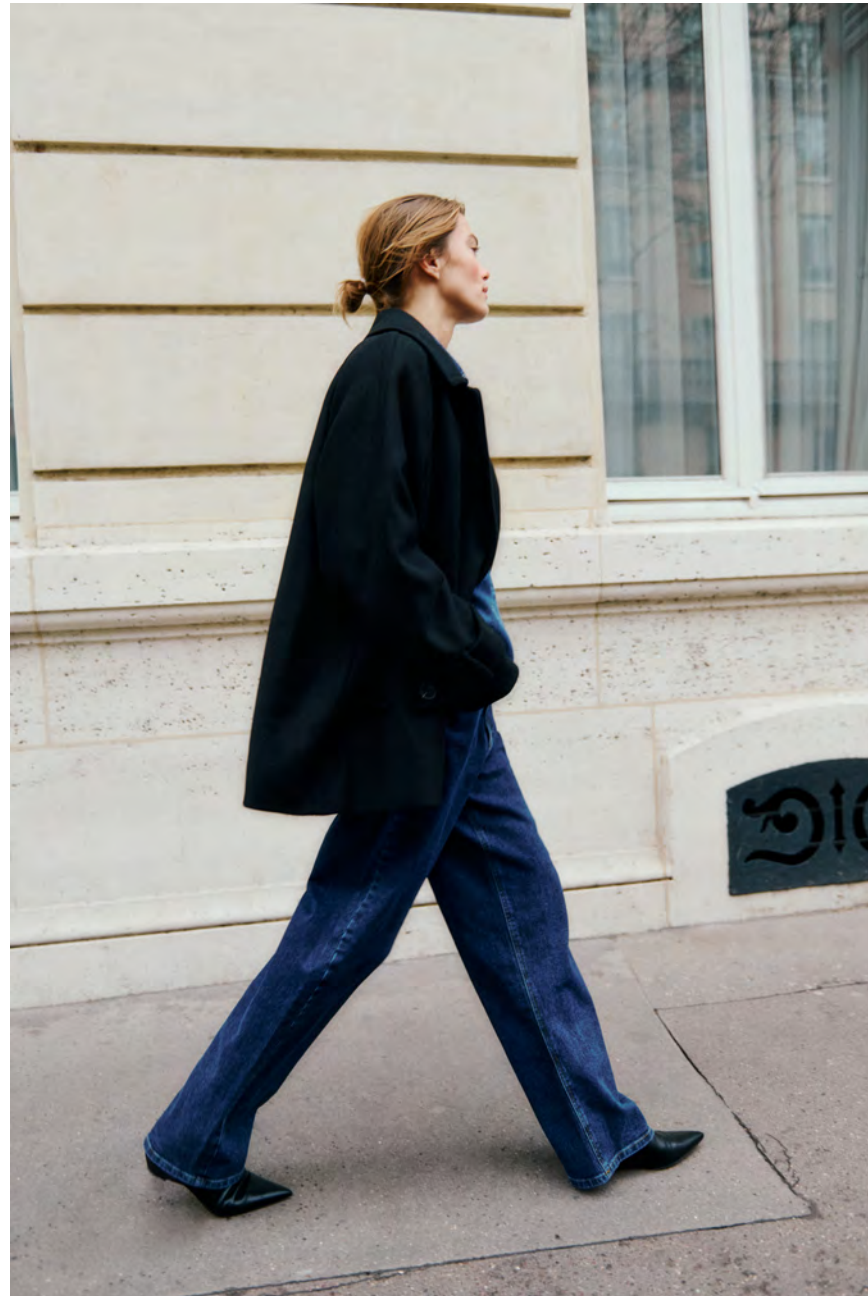
30110809 PerryIW Sailor Coat R / 30110844 NaavalIW Shirt / 30109169 PheifferIW Jeans