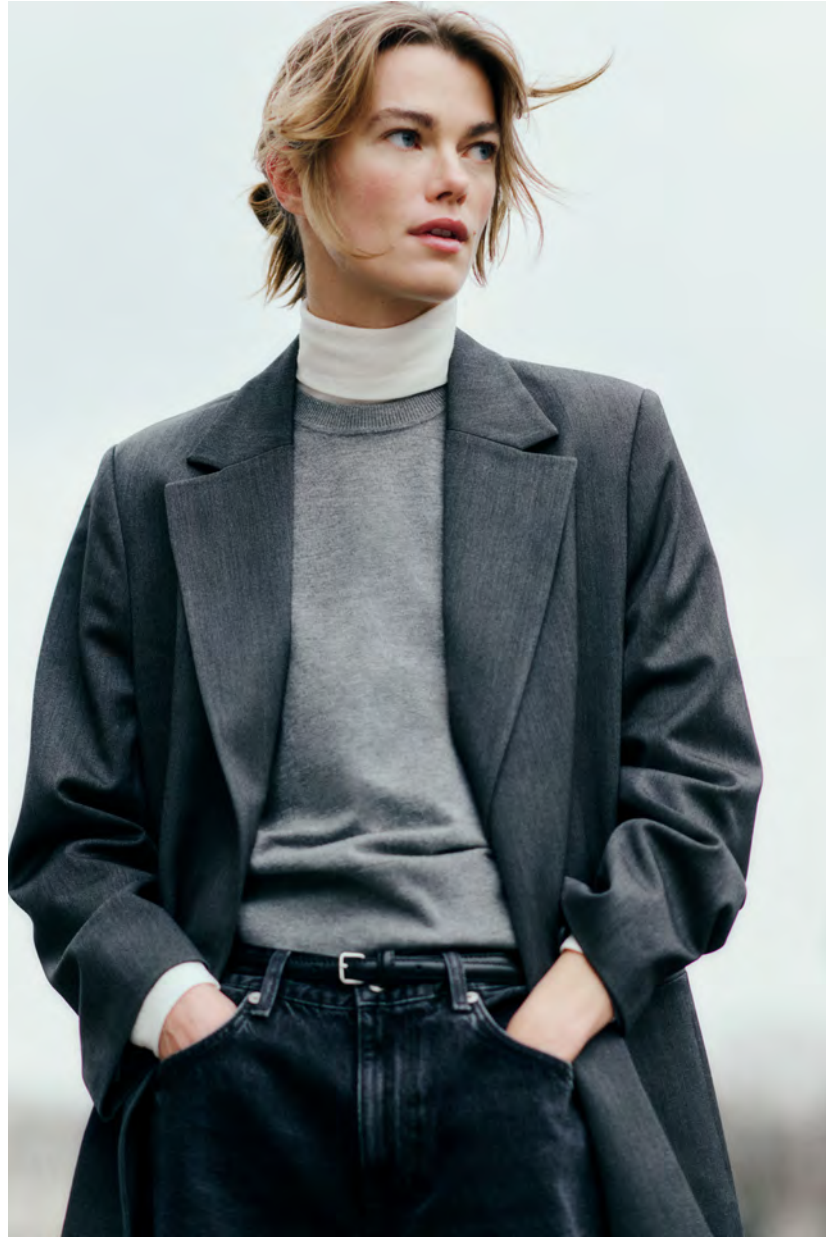
30110653 PheilW Jeans / 30106097 FangIW Rollneck / 30109743 KellsielW Pullover / 30111002 BrunildaIW Blazer / 30111030 AudriannaIW Slim belt