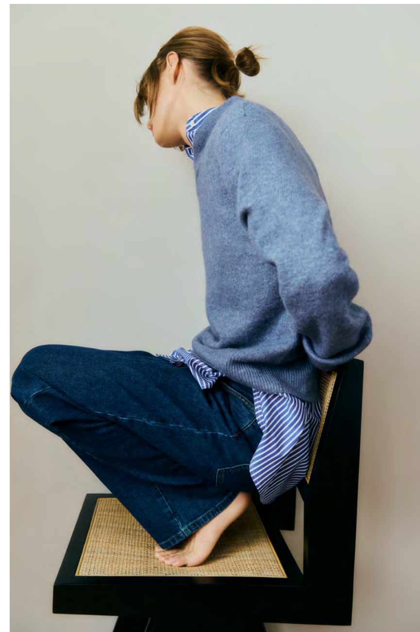
30110020 UmayalIW Trenchcoat / 30109169 PheifferIWJeans