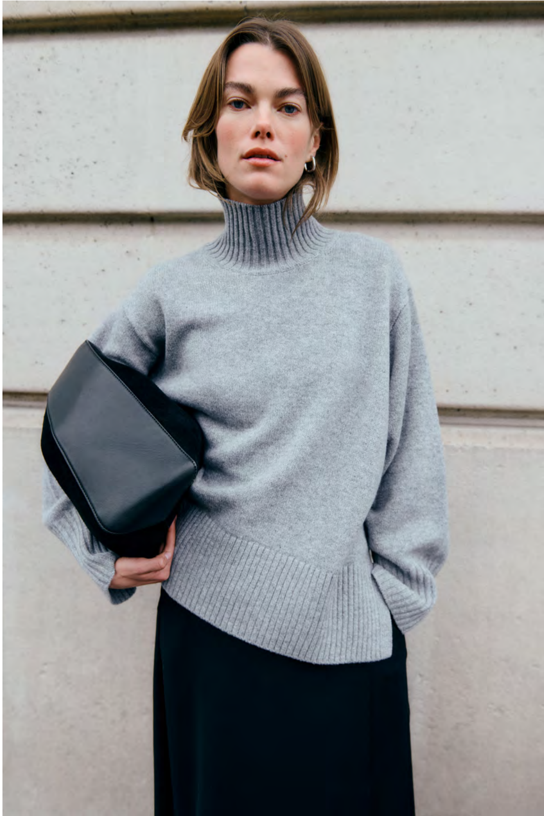
30111019 GealW Kaxy Highneck / 30110964 BrieziW Skirt / 30110717 AvikalW Bag