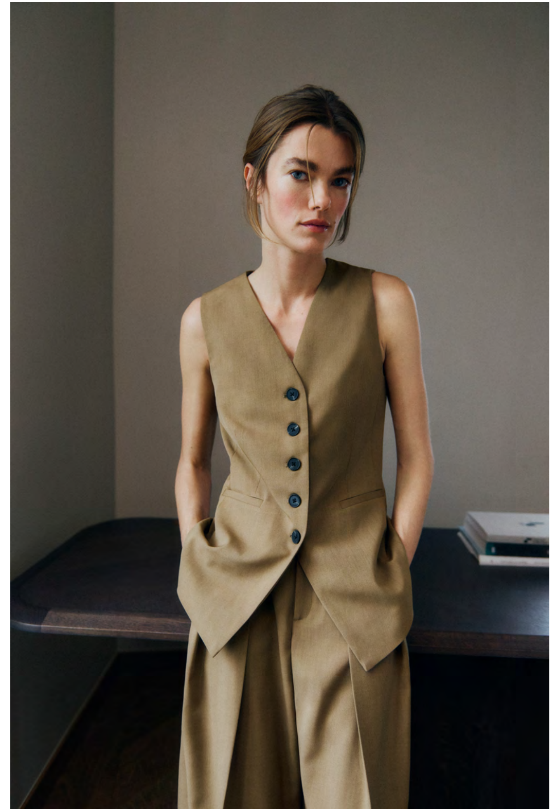
30110961 BriettalW Waistcoat / 30110959 BriettalW Wide Pants