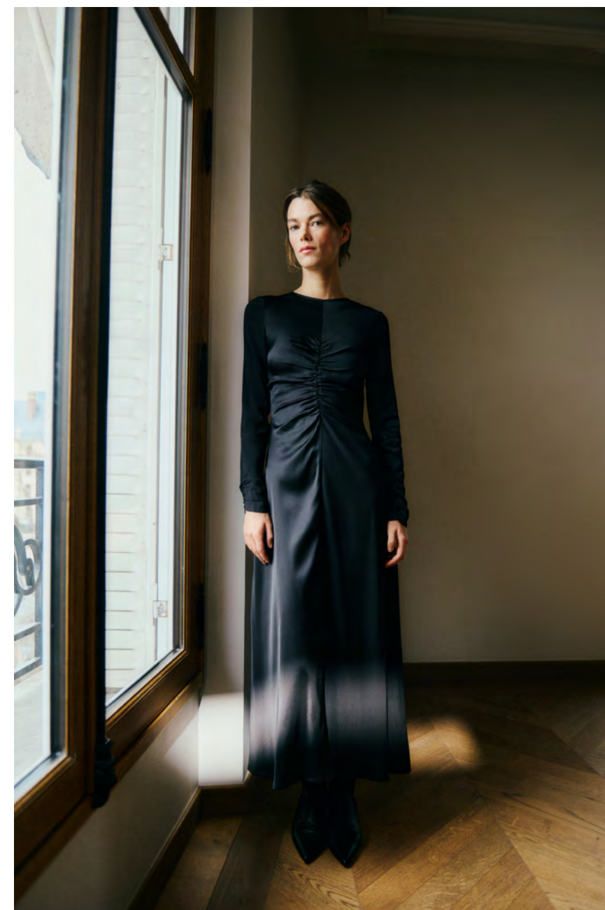
30110903 ArwenIW Long Dress