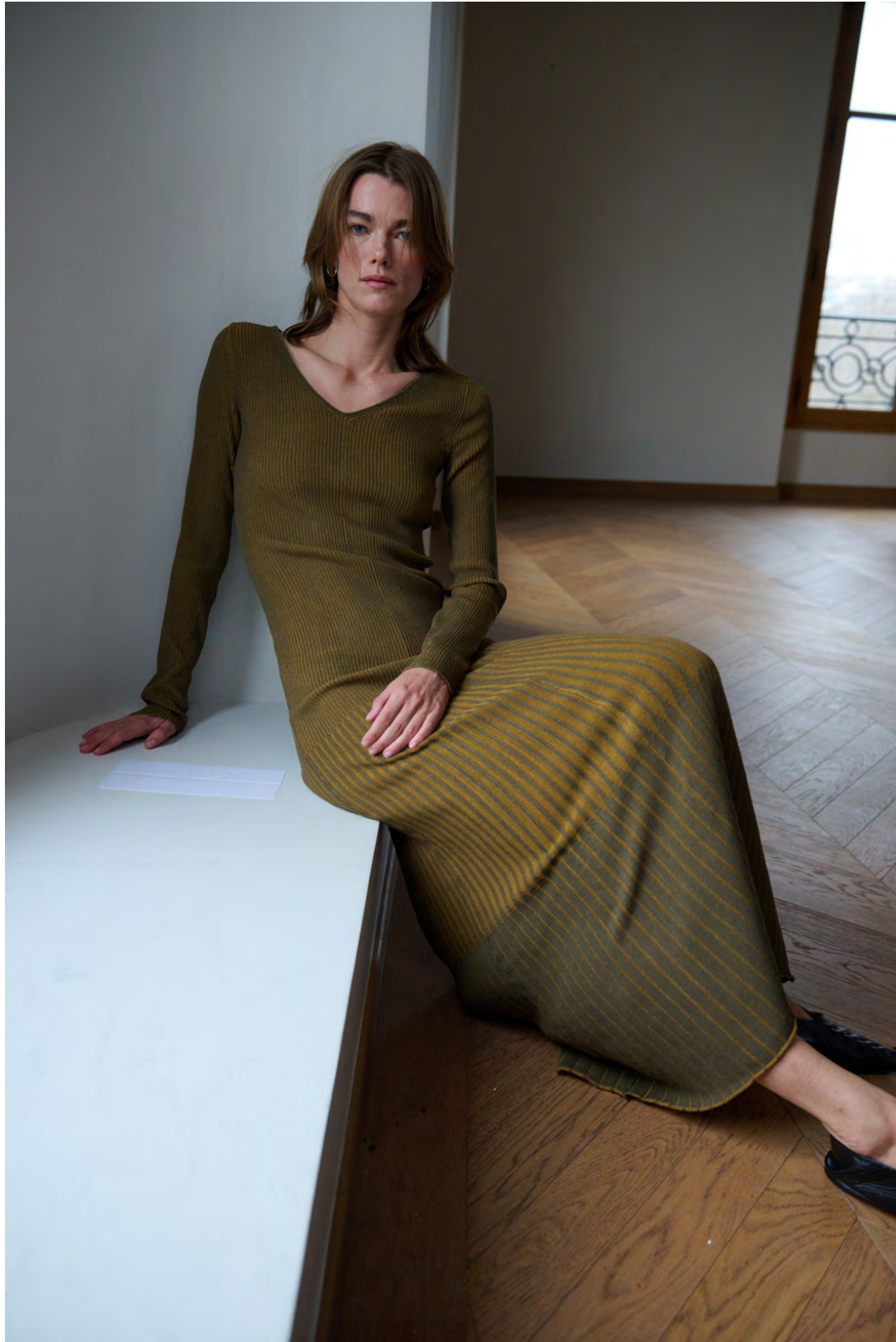
30110917 GerlyIW Dress