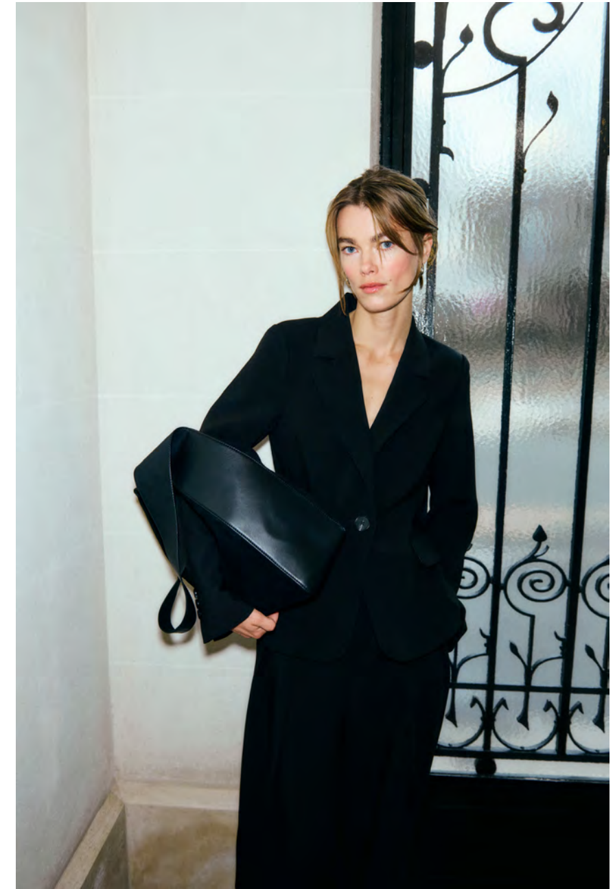
30110990 BryelleIW Blazer / 30110991 BryelleIW Wide Pant / 30110717 AvikalIW Bag / 30111065 AgnesIW Small Earring