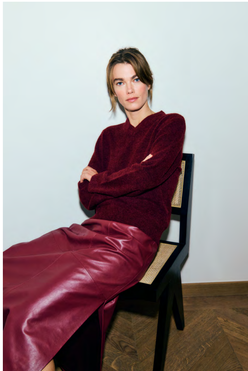
30110931 GitolW V-neck / 30110999 BrodiaIW Skirt