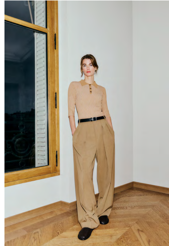
30110914 GerlyIW Pullover / 30110959 BriettalW Wide Pants / 30111029 AudriannaIW Classic Belt