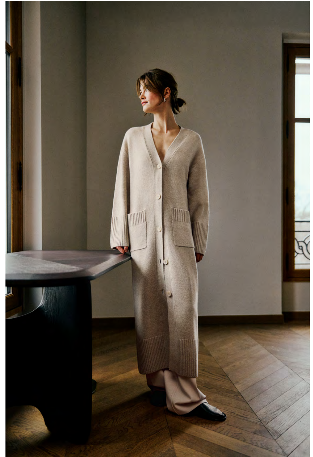
30110926 GealW Kaxy Cardigan / 30110991 BryelleIW Wide Pant / 30111065 AgnesIW Small Earring