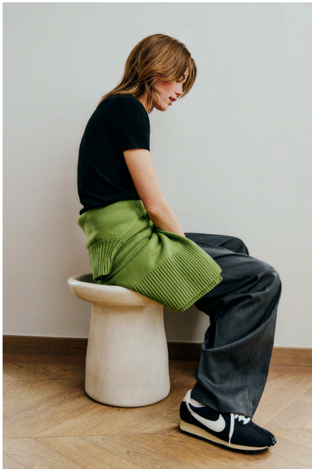
30109743 KellsielW Pullove / 30111003 BrunildalW Wide Pant / 30111019 GealW Kaxy Highneck