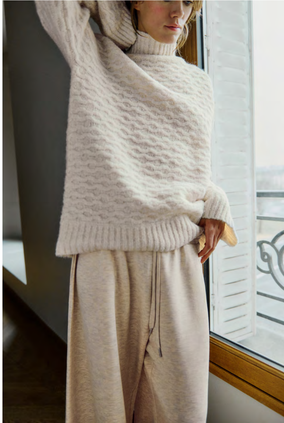
30110925 GraiaIW Pullover / 30110949 GidaIW Vincent Pants