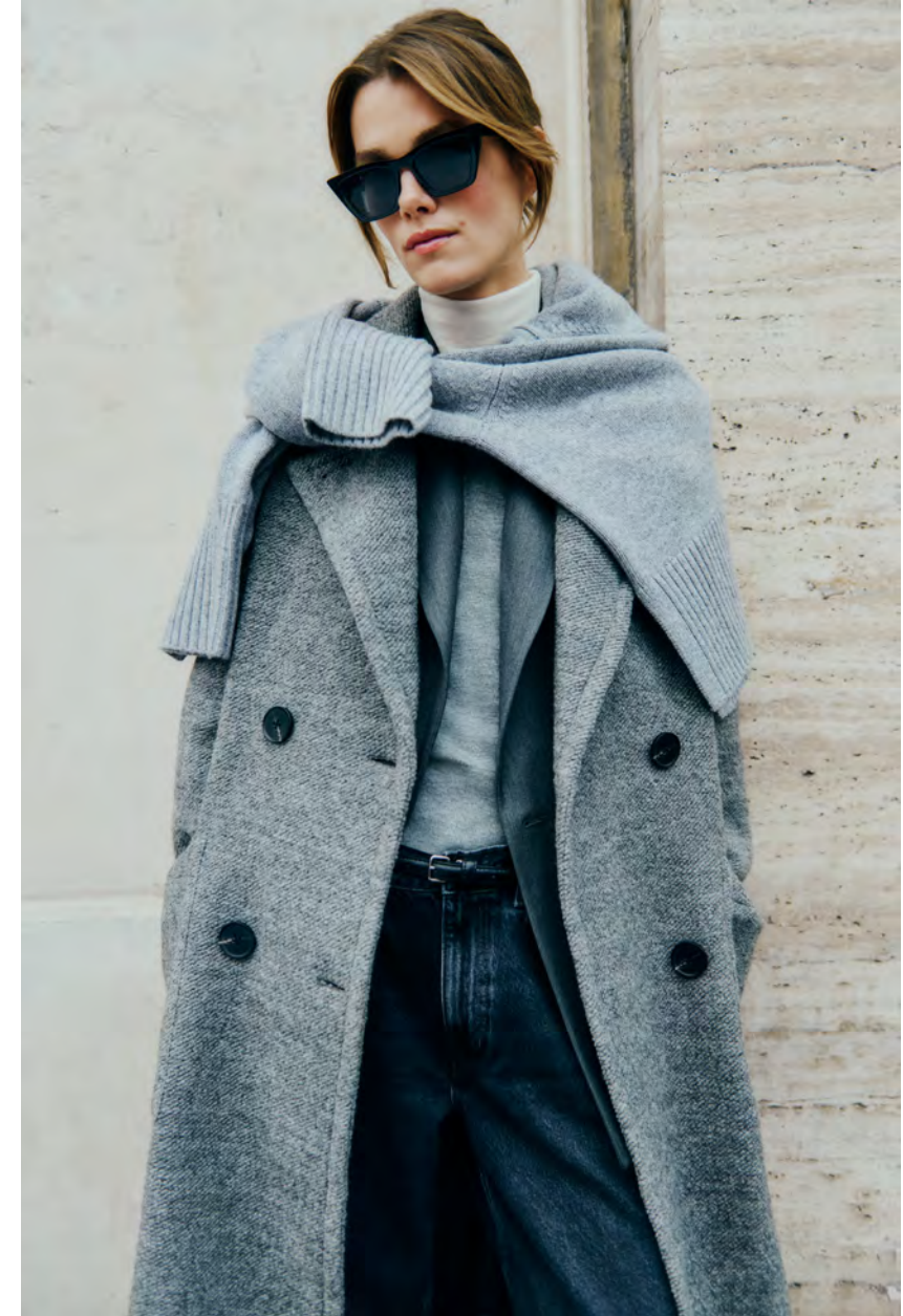
30110653 PheilW Jeans / 30106097 FangiW Rollneck / 30109743 KellsielW Pullover / 30111002 BrunildaW Blazer / 0111019 GealW Kaxy Highneck / 30111030 AudriannaW Slim belt / 30110615 YumiW DB Coat